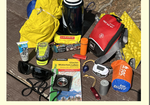
The 10 essentials.

The cost is just $10 for members and $15 for guests. We'll meet at the American Mountaineering Center in Golden on June 26th from 6:30 to 9:00 pm. Register <u>here</u> or call the CMC office at 303-279-9690.